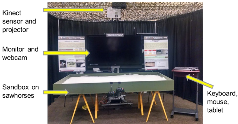
7' x 4', "squad-sized" prototype table at STTC

The Augmented REality Sandtable (ARES) [1] [4] [5] is a traditional sand table, filled with play sand, augmented with a commercial off-the-shelf (COTS) projector, LCD monitor, laptop, and Microsoft Kinect and Xbox Controllers. ARES is an example of a planar display on which the participant will view images of a military tactics scenario via central perspective projection. Central perspective involves projecting directly, without tilt, onto a surface below, providing depth cues of the terrain. For this experiment, the ARES projection technology was combined with terrain boards rather than the actual sand table.