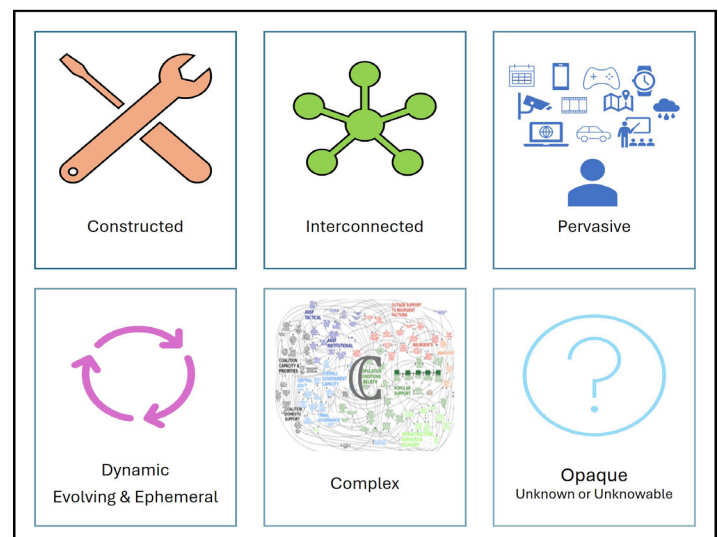
Figure 2: The unique characteristics of cyberspace

The select characteristics below exemplify the unique logic of cyberspace and its unique consequences for a planner's ability to understand the aspects of the cyberspace operational environment. These characteristics are not meant to be a comprehensive description of the fifth warfighting domain but rather illuminate why we must evaluate the operational environment for cyberspace differently than we analyze physical terrain.