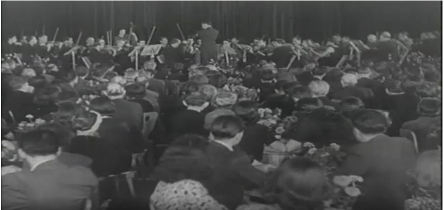
Figure 5, “Orchestra performance,” Kurt Gerron and Ivan Fric, Hitler Gives the Jews a Town, 1944.

Theresienstadt intended to depict a false reality of the ghetto in order to reduce any suspicion that the Nazis were dehumanizing and exterminating the Jewish population fooled the Danish Red Cross.