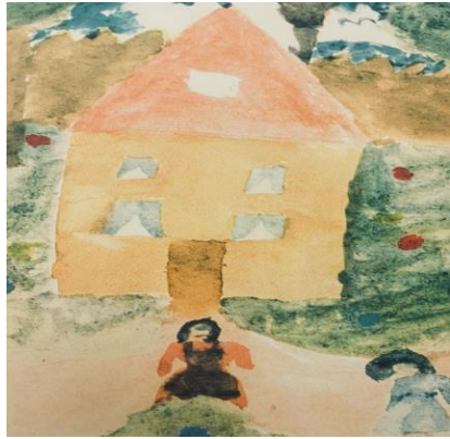
Figure 2, Marianna Langová. House with Garden . 1944. Watercolor on shiny red paper.

Before the war, many children engaged in art as a form of leisure. They drew or painted what they saw or scenes of current events. And so, just like Flack did, children responded to suffering by going back to what they knew to be normal. They painted what they saw every day in Theresienstadt: the streets, the people, the landscape. Sonja Waldsteinová was a trained and talented pupil who painted a Theresienstadt barrack in watercolor in immense detail. As seen in Figure 3, the barrack is large and imposing, dominating the composition while the colors are muted and dull, possibly expressing Theresienstadt's despondent atmosphere. Painting or drawing was a normal activity that many prisoners engaged in and allowed them to cope with and resist the Nazi's dehumanizing efforts. Waldsteinová chose to cope with the chaos surrounding her by doing what she felt was normal. 28 Acting to retain a sense of normalcy and cope with suffering and persecution allowed Jewish prisoners to display their resilience and humanity and defy the Nazi's dehumanizing efforts.