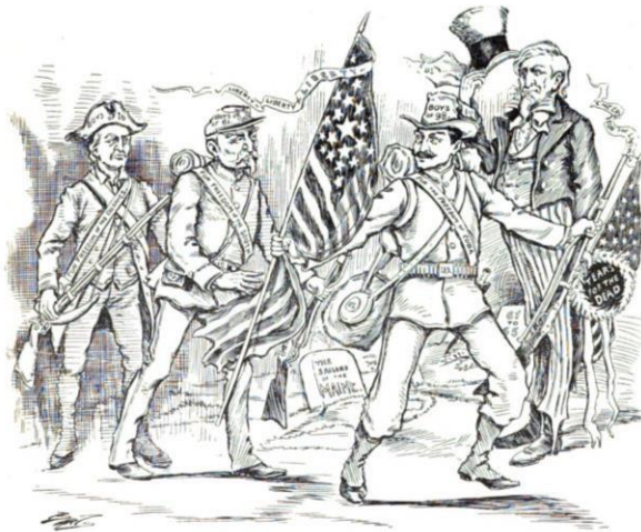
THE BOYS OF '76 AND '61 PASS ON "OLD GLORY" TO THE BOYS OF '98.