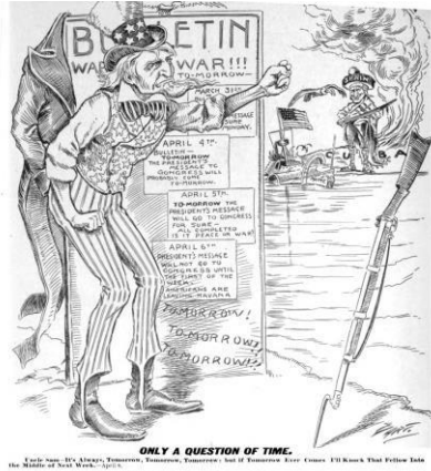
Figure 2: Only a Question of Time (April 8, 1898), Source: Charles Bartholomew, Cartoons of the Spanish-American War (Minneapolis: Journal Printing Company, 1899), 40.

Miller's book argues that the American call to war in Cuba was driven primarily by a sensationalist movement among journalists. She portrays media in the United States as a competition which could often be taken out of hand by newspapers and a deep analysis of political cartoons of the pre-war years supports her claims. Figures 2 and 3, in particular, sternly advocate for war despite their lack of basis or reasoning for going to war. Figure 2 displays a hawkish sense of excitement for war with its illustration of Uncle Sam's cocked fist, the removal of his jacket, and a sinister-looking Spaniard standing over the wreckage of the Maine . This cartoon operates on multiple assumptions. Firstly, the United States is eager for and fully prepared to go to war and secondly, the only thing holding the country back is a direct order from the commander-in-chief. The cartoon is an effective propaganda source because it paints all of these assumptions as truths for the American public.