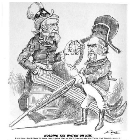
Figure 1, “Holding the Watch on Him” (March 21, 1898), Source: Charles Bartholomew, Cartoons of the Spanish-American War (Minneapolis: Journal Printing Company, 1899), 35.

the explosion at the time. 4 Thus, the historiography of the nineteenth century Cuban independence movement played a significant role in the public's reaction to the Maine's explosion and their perception of the war. Without any historical perspective, Americans failed to see the implications of the Maine's approach into Havana Harbor.