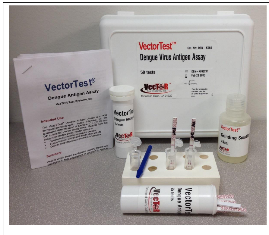
Figure 4: Arthropod Vector – Rapid Detection Devices (AV-RDDs), better known as “dipstick” tests, come in kits that contain sample holding tubes, grinding tools and the buffer solutions necessary to run the test. The AV-RDD targets arthropod-borne diseases, a primary readiness threat to warfighters.

These two techniques used in combination with chemical control methods such as insecticides and larvicides can prevent DENV infection. With the addition of permethrin-treated uniforms and chemical insect repellants, a DENV infection is preemptively combated to protect military personnel [25]. Along with the vector control methods of reducing contact and chemical controls, biological control methods have been focused on effectively reducing DENV transmission in areas where the risk to deployed military forces is greatest. Interventions are being developed to include reducing the mosquito population by manipulation of female mosquito behavior as well as replacing endogenous DENV infected mosquitoes with ones that are unable to transmit the virus [33]. Some courses of action to address the mosquito population include introducing male mosquitoes with Wolbachia bacteria, which renders them reproductively incompatible or genetically engineering mosquitoes that need a drug added to their larval diet to survive [33]. It is important to note that vector-borne pathogens such as DENV are not uniformly or randomly distributed