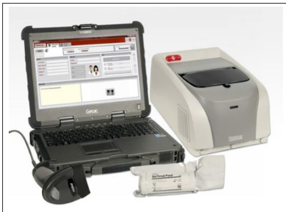
Figure 3: The Next Generation Diagnostics System Increment 1 (NGDS-1), also known as the Bio Fire Film Array® 2.0. This figure was extracted from Next Generation Diagnostics System, Increment 1 Fact Sheet, 7/27/2017. Point of Contact: Chemical, Biological, Radiological, & Nuclear Information Resource Center (CBRN IRC), CBRN.IRC@mail.mil , Toll Free: 18008314408, Commercial: (309) 7827349, DSN: 7937349, Fax: (309) 7821919.