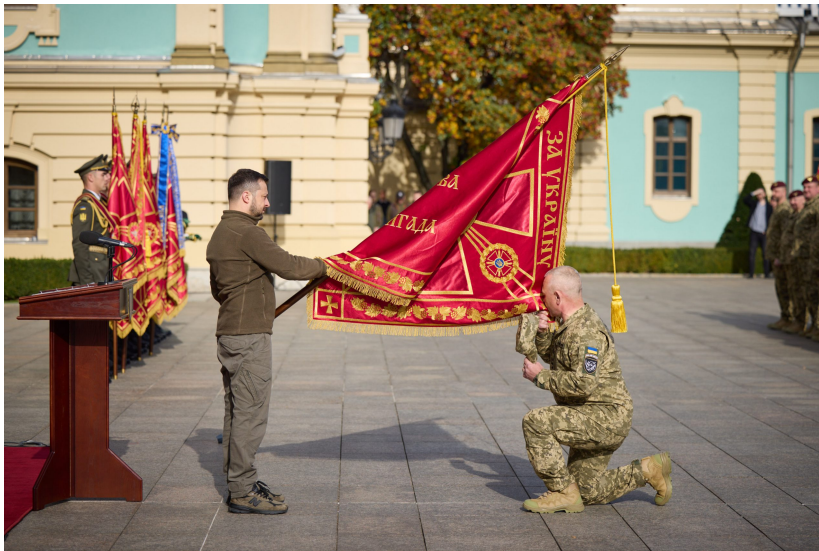
Photo: President Volodymyr Zelenskyy took part in events on the occasion of the Day of Defenders of Ukraine.

Russia has moved from Soviet-style warfare to self-pitying introspection, but remains dangerous and must be defeated.